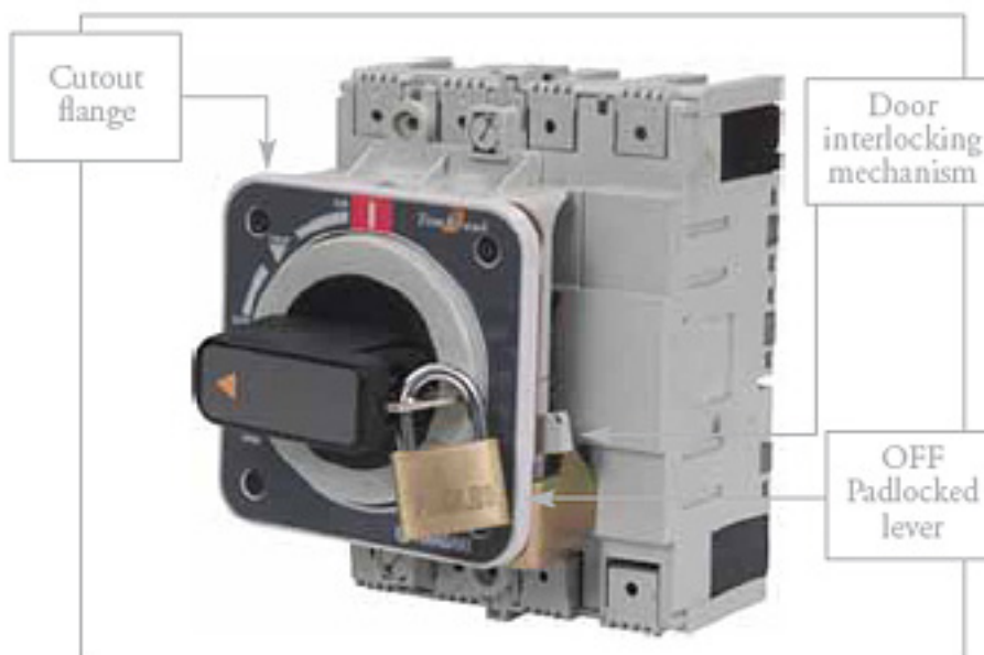
Breaker Mounted Handle Padlocked in the OFF Position

This external operating handle is used to operate a circuit breaker mounted just behind a compartment door with the door closed. The operating unit and handle itself are mounted directly on the circuit breaker. The handle protrudes through a cutout in the door. A mounting door flange is supplied with the external operating handle which covers the cutout from the front.