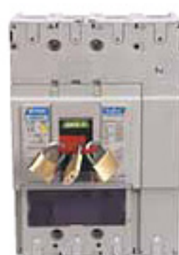
S400 Locked OFF

Fittings for Castell and Fortress locks are available. They are suitable for use on toggle-operated MCCBs, or on door mounted handles (HP) for MCCBs.