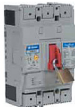
S250 Locked OFF

Toggle locking devices allow MCCBs to be locked ON or OFF using up to three padlocks. Locking devices for 125A, 160A and 250A frame models accept padlocks with 5mm hasp diameter. Locking devices for 400A and 630A frame models accept padlocks with 8mm hasp diameter.